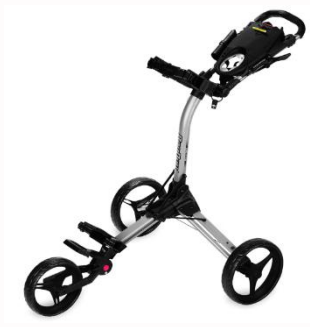
Wish List Item

I know that this looks scary, but then I think of our mission statement which says Our mission is to provide a Christ-centered education to assist families in nurturing students as lifelong disciples of Christ and I see that is what GPLHS is doing! I am thankful to be reminded that this ministry is important. What we do here at GPLHS is a blessing to our families, students and churches. The ministry of GPLHS is needed today and will always be needed until our Savior comes. Knowing this I am confident that God will continue to bless this ministry through each and every one of you and we will be able to address this budget deficit.