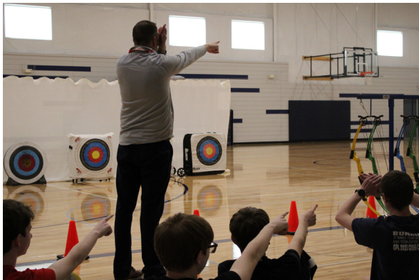
Teaching archery in PhyED

The curriculum of these four courses covers a wide range of material and areas of focus. Health and Physical Education emphasizes how to make healthy lifestyle choices and behaviors while giving glory to God with the bodies he has given us. American