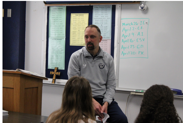
Teaching Health class

It's more than football, it's more than basketball, it's more than the class that you are taking. It's learning how to handle the emotions of every experience.